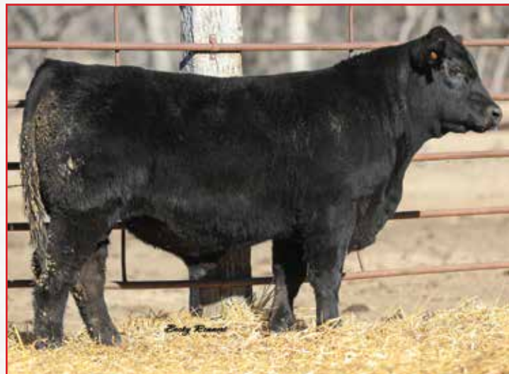
HUNT JUSTIFIED 163M

BULL • PERCENTAGE(84/74) • HOMO POLLED (P-2) • HOMO BLACK (T) 03/09/2024 • NXM3126333 • HUNT 163M