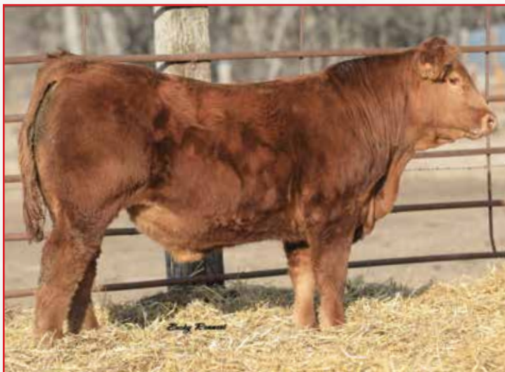
HUNT GUNNER 196M

BULL • PERCENTAGE(79/71.4) • HOMO POLLED (P-2) • RED 03/25/2024 • NXM2799597 • HUNT 196M