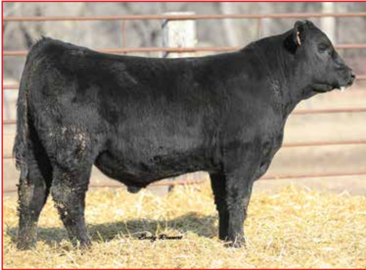
HUNT MAKERS MARK 144M