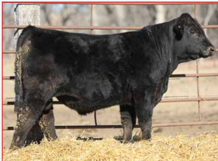
DANH JUSTIFIED 93M

The mating of Justified with a young FILL Danny 211D daughter really worked well here. 93M is HOMO black, HOMO polled, purebred with tons of growth. He is above average for length and frame and shoots to the Top 1% for WW & YW EPDs, very impressive! Top end Docility and $TPI as well. He takes a long step, lands on a good square foot and is real easy going. This purebred bull should be on the top of your list. Find his video at www.huntlimousin.com