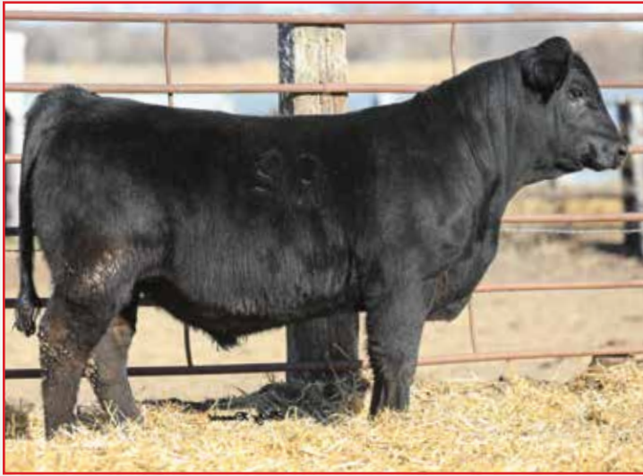
HUNT MICHIGAN 126M