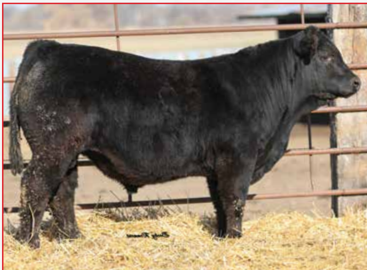
HUNT ELLIS 193M

BULL • PERCENTAGE(76/66.6) • HOMO POLLED (P-2) • BLACK 03/24/2024 • NXM2799600 • HUNT 193M