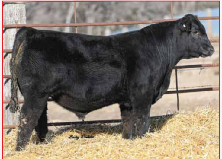
HUNT JUSTIFIED 78M

BULL • LIM-FLEX(75/65.9) • HOMO POLLED (P-1) • BLACK 02/13/2024 • LFM3126078 • HUNT 78M