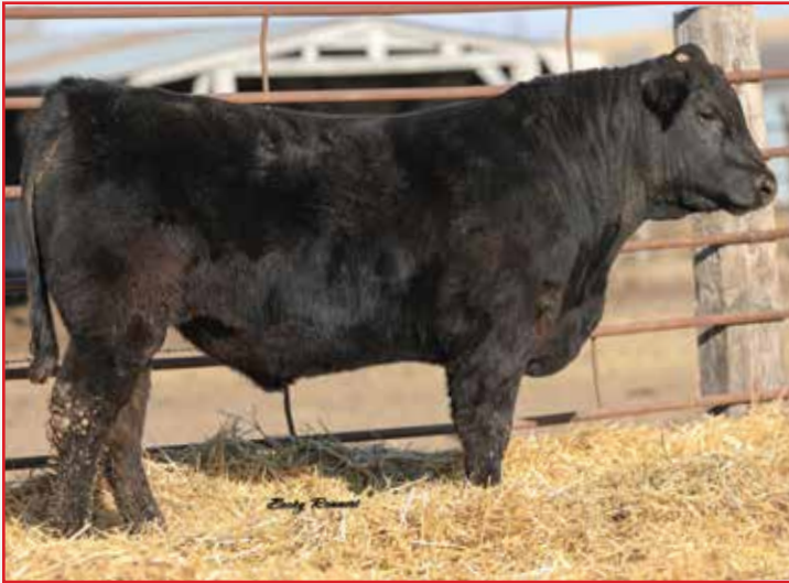
HUNT ESQUIRE 102M