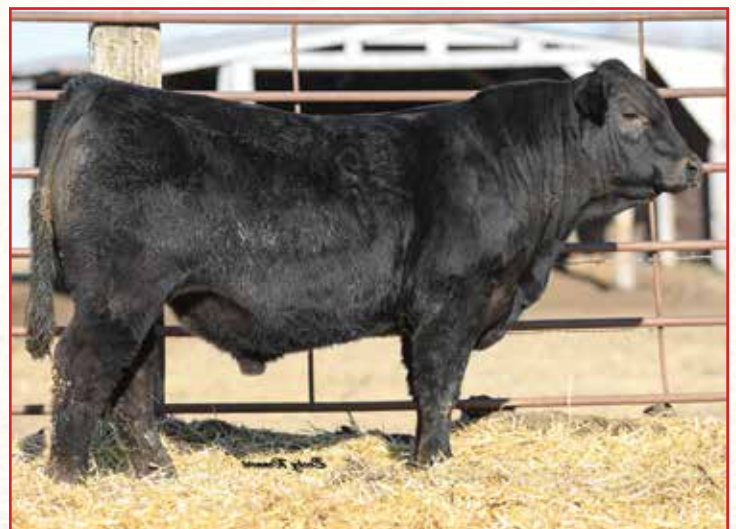
HUNT 18J 53M

HUNT 53M is a nice, complete, functional bull. He is made long spined with a smooth shoulder. His calves will come easy and all will be polled. His dam is one of our oldest, most proven cows. Find his video at www.huntlimousin.com