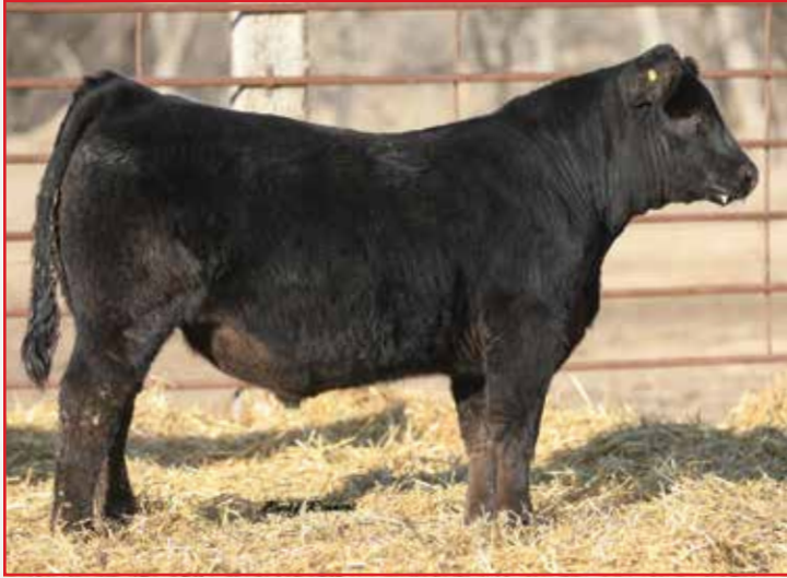
HUNT ELLIS 209M