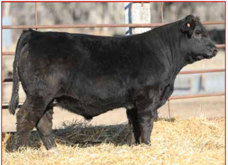
HUNT 'MERICA 92M

BULL • PUREBRED(93/83.3) • HOMO POLLED (P-1) • HET BLACK (T) 02/17/2024 • NPM3126165 • HUNT 92M