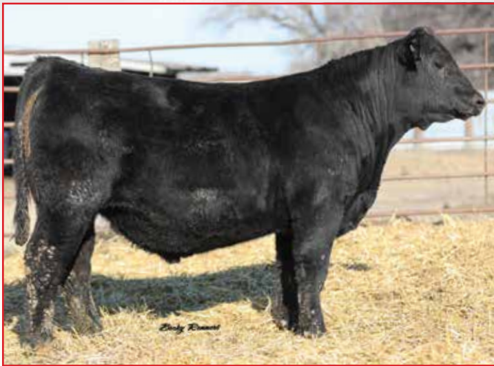
JEHH MONEY-MAKER 80M

HUNT 36M is a hetero black, HOMO polled, 68% Lim-Flex, ET calf sired by HUNT Gambler 140G x HUNT Miss SAV Bird 04D. 36M is chocked full of muscle! He's deep, wide and thick! If you need to add a shot of ribeye or clean up the Yield Grade of your finished cattle, take a look here. Need a few bulls, look at his two full brothers, HUNT 60M & HUNT 98M. Find his video at www.huntlimousin.com