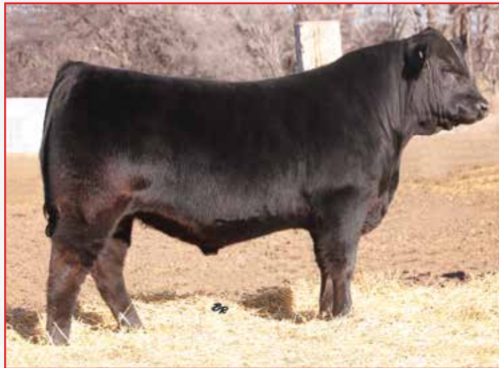
DANH DURHAM 54D • Paternal grandsire of DANH 80H 03M

BULL • LIM-FLEX(65/57.3) • DBL POLLED (SC) • HET BLACK (T) 02/28/2024 • LFM3125288 • DANH 03M