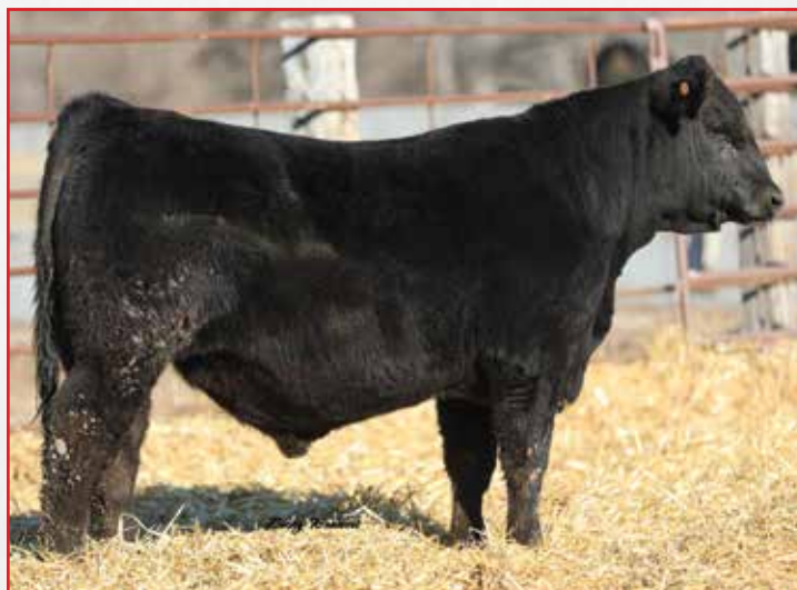
HUNT DAVES JUSTIFY 120M

HUNT 120M we really like a lot. Another Justified son that will give you calves that are all black and polled, are born easy, and grow fast. Check out his numbers.... Top percentiles for CED, BW, WW, YW, CEM, DOC, YG, and REA!! He is easy to find when studying through the pen of Private Treaty bulls.... long, deep, thick, attractive, calm and he hits on all cylinders. Find his video at www.huntlimousin.com