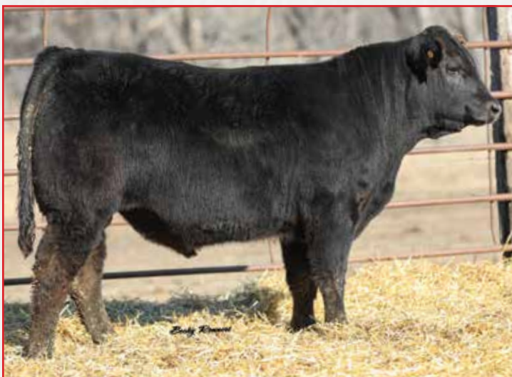
HUNT JUSTIFIED 131M

Here's another double HOMO Lim-Flex son of Justified. He's a bit more moderate than most of the Justified sons, but equally as good. Find his video at www.huntlimousin.com