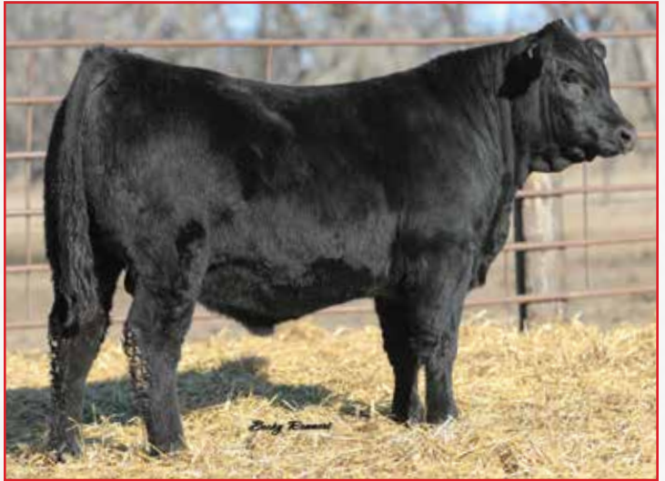
HUNT JUSTIFIED 90M

BULL • LIM-FLEX(65/57.1) • HOMO POLLED (P-2) • HOMO BLACK (P-2) 02/17/2024 • LFM3132924 • DANH 90M