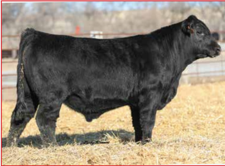
HUNT GRANDSLAM 88M