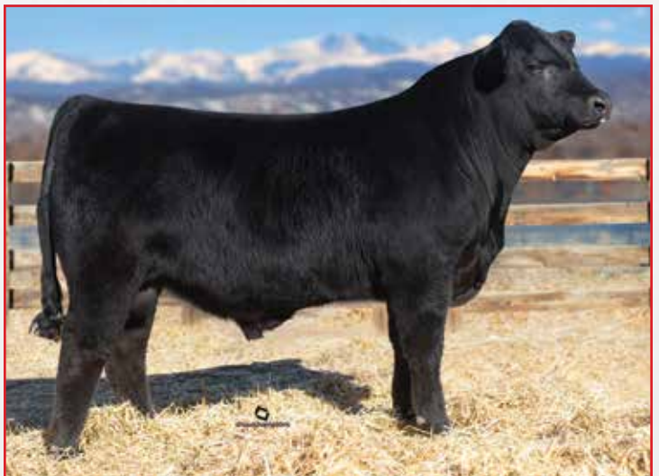
HUNT GAMBLER 140G • Sire of HUNT 3849 X Gambler 98M ET

BULL • LIM-FLEX(68/61.1) • DBL POLLED (SC) • HET BLACK (T) 02/18/2024 • LFM3135182 • HUNT 98M