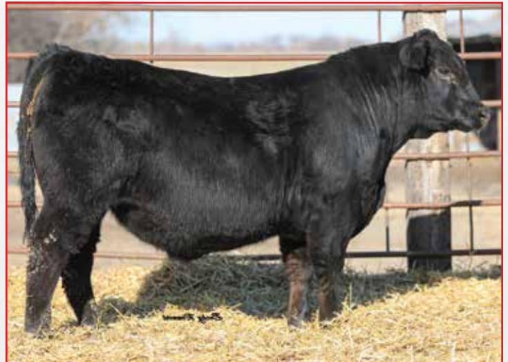
JEHH MOCHA 87M

BULL • LIM-FLEX(56/47.3) • HOMO POLLED (P-1) • HET BLACK (T) 02/15/2024 • LFM2799565 • JEHH 87M