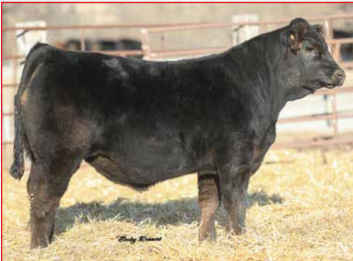
HUNT JUSTIFIED 101M

HUNT 102M is the bull to buy if you have a set of middle-aged cows that need to be stretched out a bit. He's as long as any bull we raised this year with great WW & YW EPDs, HOMO black and HOMO polled as well. Find his video at www.huntlimousin.com