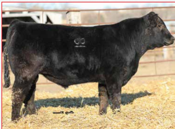
HUNT JUSTIFIED J02M

BULL • LIM-FLEX(75/65.6) • HOMO POLLED (T) • HET BLACK (T) 03/01/2024 • LFM3181946 • HUNT J02M