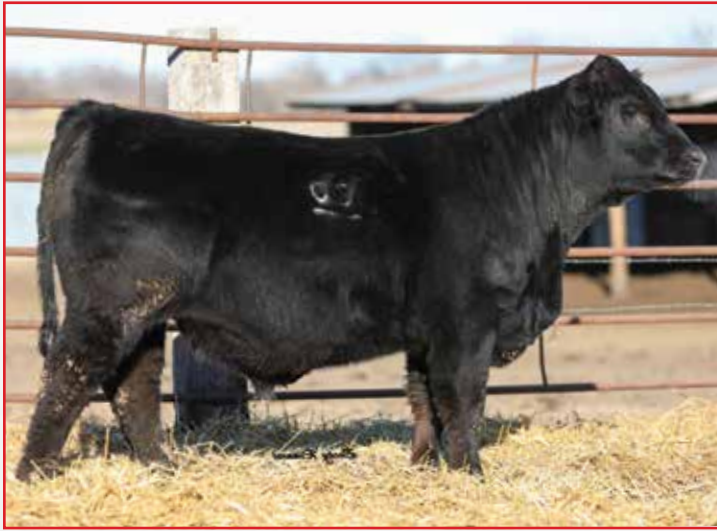
DANH JUSTIFIED J03M