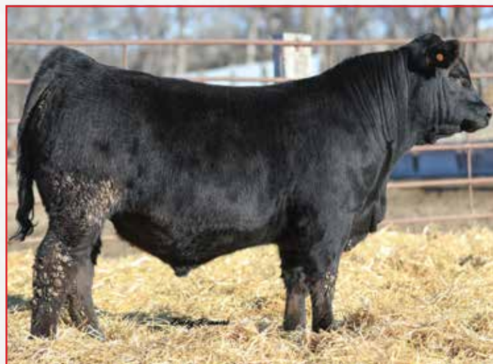
HUNT MANSION 165M

BULL • LIM-FLEX(51/45.6) • HOMO POLLED (P-2) • HOMO BLACK (P-3) 03/09/2024 • LFM3126335 • HUNT 165M