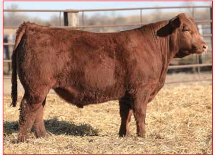
HUNT EASY GOING 47M

Here is a dark red, HOMO polled, purebred bull that will absolutely work well on virgin heifers. He had an actual birth weight of 67 pounds, is in the Top 5% for CED, Top 10% for BW, Top 3% for Docility and has 4 carcass EPDs in the Top 30%. He is moderate and will be able to breed your replacement heifers for many years! Watch his video and you'll be impressed by his clean neck through shoulder and small head with plenty of rib depth and muscle. Find his video at www.huntlimousin.com