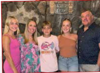
The Hunt Family