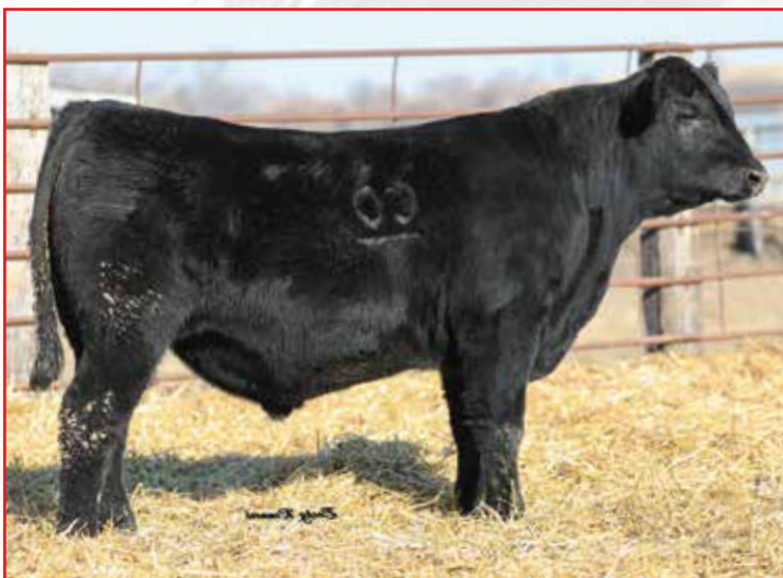
HUNT BRICKYARD 44M