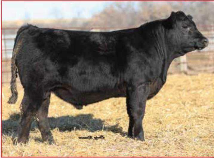
HUNT MAKE IT RAIN 36M ET