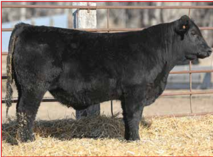
HUNT JUSTIFIED 127M

HUNT 126M is easily one of the top bulls in the Private Treaty pen. We really appreciate his long, powerful hip, wide top and easy-going demeanor. Top 15% or better for WW & YW, HOMO black, HOMO polled, super good bull. Whoever owns 126M can expect his calves to top the markets for years to come! Find his video at www.huntlimousin.com