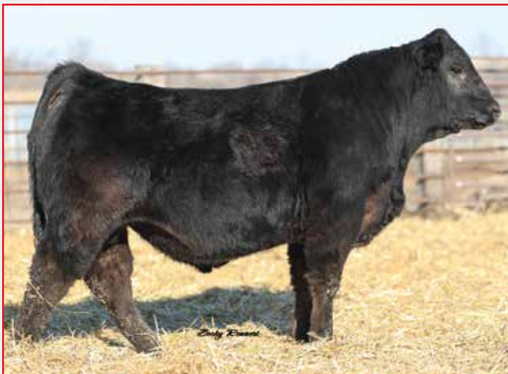
HUNT 71K 154M

HUNT 151M is one of the top purebreds we have to offer this year. He's solid all the way through, extra length, depth and natural muscle shape. HOMO polled and in the Top 15% for Marbling. His calves will grow fast and hang valuable carcasses. Find his video at www.huntlimousin.com