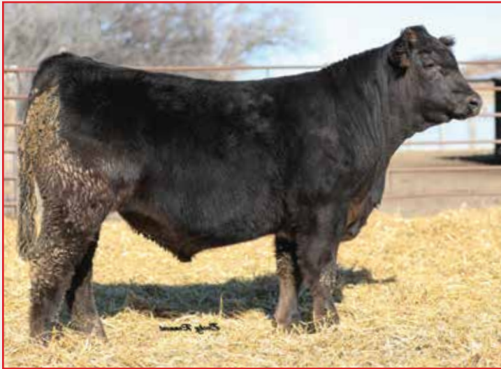
HUNT JUSTIFIED 66M

Here is another Gambler sired ET calf, full brother to HUNT 36M & HUNT 98M. 60M is one of the heaviest bulls in the Private Treaty pen. He's extremely long bodied, smooth shouldered and full of red meat! Find his video at www.huntlimousin.com