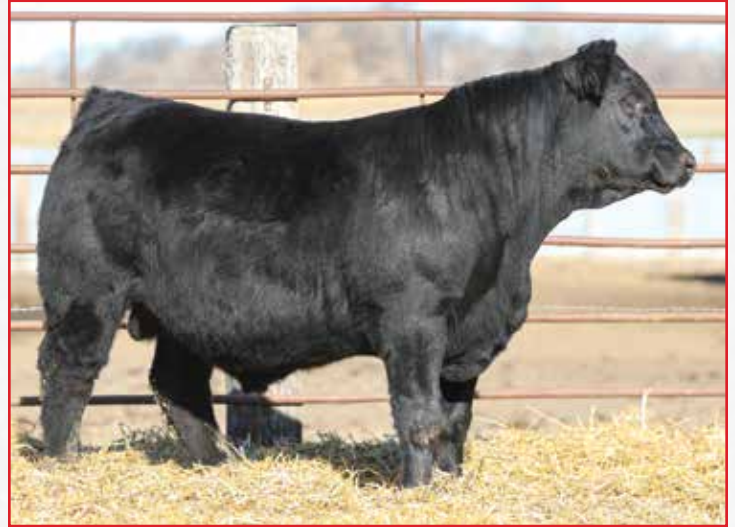
HUNT FAULTLESS 77M

BULL • LIM-FLEX(64/56.7) • DBL POLLED (SC) • HOMO BLACK (T) 02/13/2024 • LFM3126077 • HUNT 77M