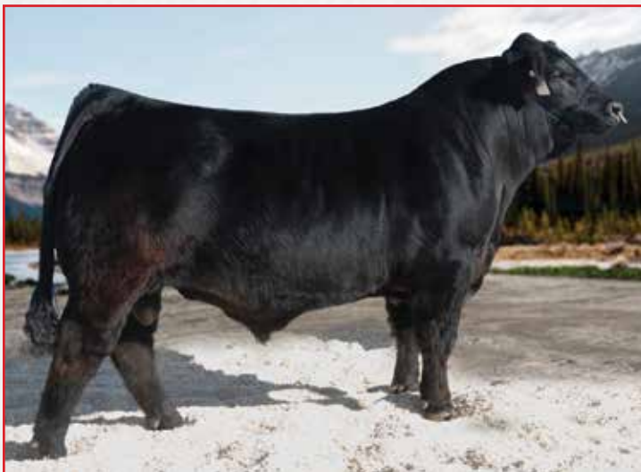
RUNL JUSTIFIED 364 J • Sire of multiple bulls selling

Here's another interesting Justified son. Negative BW EPD and Top 10% WW & YW EPDs.... crazy!! We love his smooth, angular shoulder and back into a deep wide chest and wide butt. Single black and HOMO polled with an 85 pound birth weight. Find his video at www.huntlimousin.com