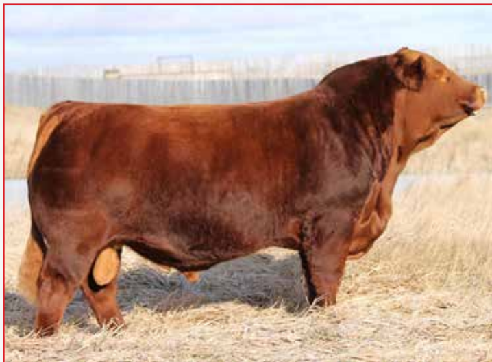
HUNT CREDENTIALS 37C ET • Sire of CLYT Credentials 30M

BULL • PERCENTAGE(71/64.4) • HOMO POLLED (P-1) • RED 02/02/2024 • NXM3126367 • CLYT 30M