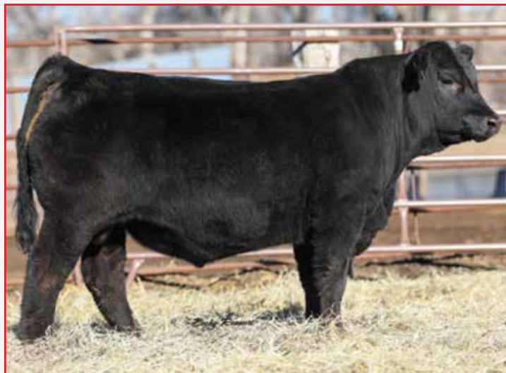
HUNT CREDENTIALS 113L

HUNT 113L is a bull that breeders and commercial producers both need to find. PUREBRED, HOMO polled, and can be used on heifers! You won't find many around as good as this one. Sired by Ccredentials and out of a Billy Ray second-calver. Her calf last year we kept to use on our commercial heifer program. 113L has top end EPDs for CE, BW, Milk, CM and Docility, things that most any herd can work to improve. If he's not available, it's probably because we've decided to keep him. Find his video at www.huntlimousin.com