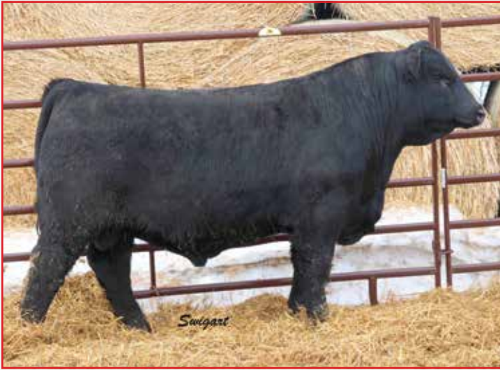
AHCC DAKOTA THUNDER 363D • Sire of JEHH Lucky 41L