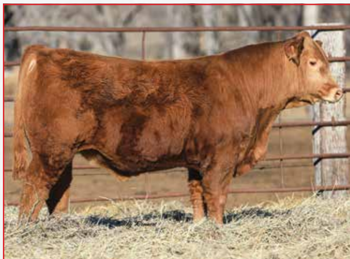
HUNT GAME X D35A 107L ET

HUNT 107L is a red, three-quarter blood Lim-Flex, sired by Game and the D35A cow and super good. If you need a pair of full brothers that will make your calf crop nice and uniform, put him with HUNT 71L and we'll make a deal for both of them!! Find his video at www.huntlimousin.com