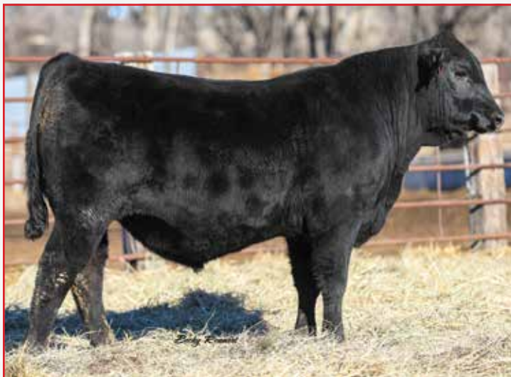
HUNT DURHAM 94L