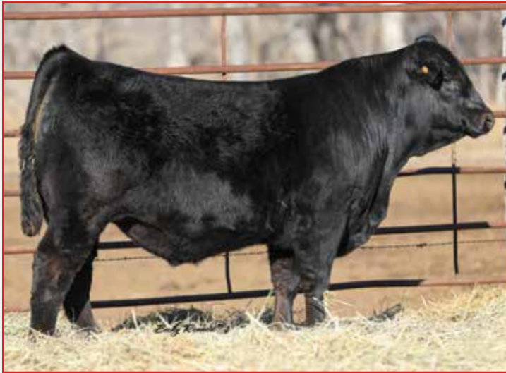
HUNT CABLE 104L