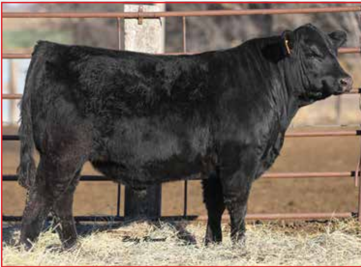
HUNT DAKOTA 14L

HUNT 11L is long bodied, strides out well and is as calm as they come. Sired by the popular Wulfs Genius, and by a first calf heifer. He has plenty of muscle and still offers great calving-ease, being in the Top 5% for CE and 1% for BW (-3.5). Find his video at www.huntlimousin.com