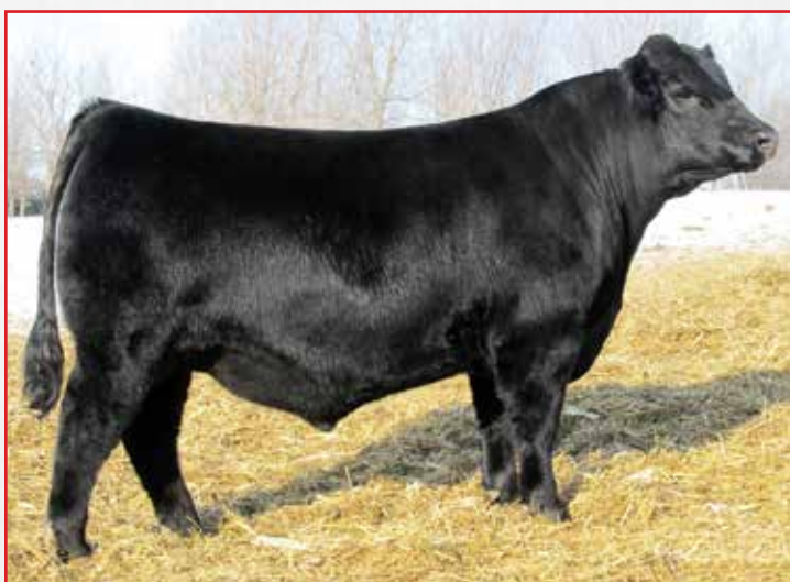
WULFS STIMULUS 2009Z • Sire of HUNT Long Beach 99L

HUNT 99L is easily one of the top bulls in the pen. It doesn't matter if you're wanting to develop your own replacements, sell them all at weaning, or retain them through the packing house, 99L won't disappoint. Really good calving-ease numbers to go along with ample growth and above average carcass numbers. DOUBLE HOMO as well. Take a long look at this one!! Find his video at www.huntlimousin.com