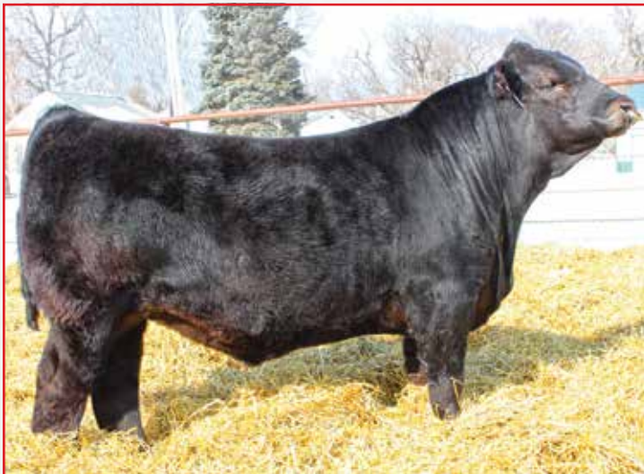
WULFS GENIUS 5293G • Sire of HUNT Genius 49L

DANH 17L. Here is a really neat opportunity to take home an awesome, HOMO polled, PUREBRED, ET calf sired by AHCC Earning Power and by one of our best-ever purebred, Yankee daughters. 17L pushes the Marbling EPD clear to the top end, being in the 4th percentile, as well as 4th percentile for $MTI. He is full of muscle too. Watch his video and you'll see what I mean. Impressive on paper and equally impressive in person. Find his video at www.huntlimousin.com