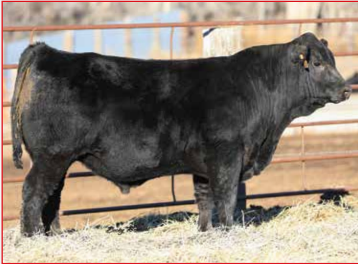
HUNT FERDINAN 145L