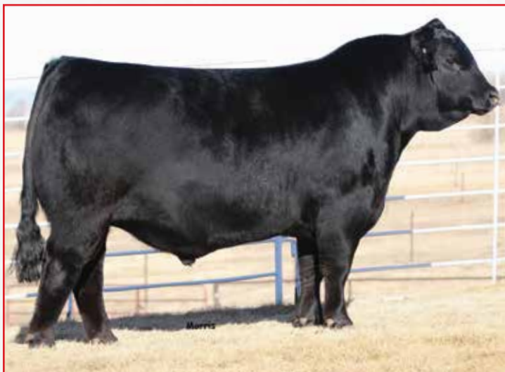
MAGS CABLE • Sire of HUNT Cable 100L

HUNT 100L, sired by Cable, who most breeders consider one of the best 50% LimFlex bulls ever raised, and 100L is very typical for a Cable son...deep ribbed, easy-going and very complete. You'll also notice how complete his EPD profile is...Top 5% for CE and Top 15% for WW, that's not an easy combination to come by. HOMO polled and single black. Find his video at www.huntlimousin.com