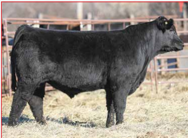
DANH FLAT TOP 15L

DANH 15L has the numbers that everyone looks for...outstanding calving-ease, growth traits above 25%, great milk, and amazing carcass numbers too. Whoever takes 15L home will be glad they did, probably the best EPDs in the entire calf crop this year. Find his video at www.huntlimousin.com