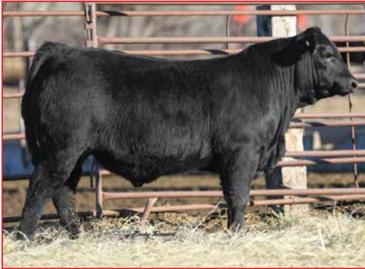
DANH EARN X 3730 17L ET