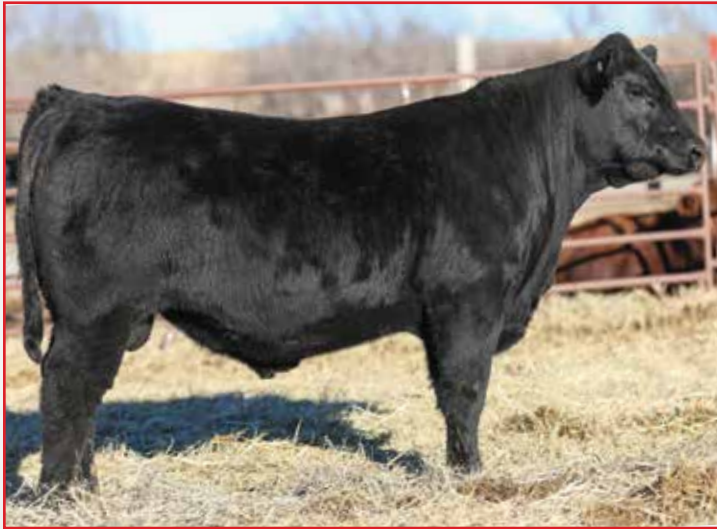
DANH EL TORO 54L