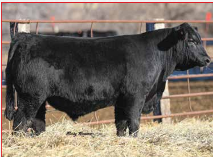
HUNT YUKON TWIN 54L

Here is a HOMO polled, HOMO black, 70% Lim-Flex. This bull has extra muscle, and a very attractive shoulder, neck and head. If you want to add style to your calves and be able to produce fancy show steers or heifers, this is the bull to buy. Find his video at www.huntlimousin.com