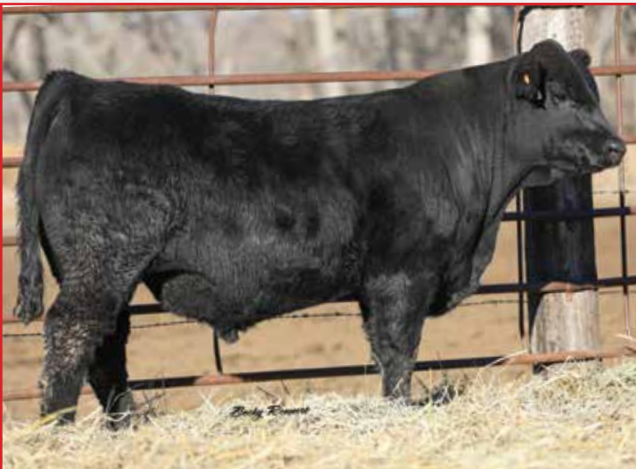
HUNT 80H 216L