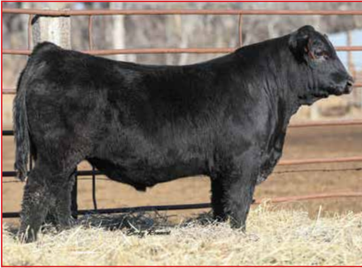
HUNT GENIUS 11L