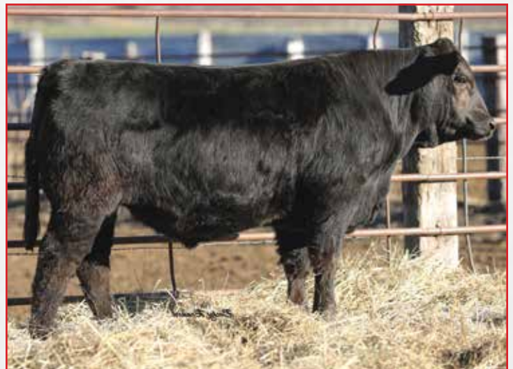
HUNT GAYLORD 39L