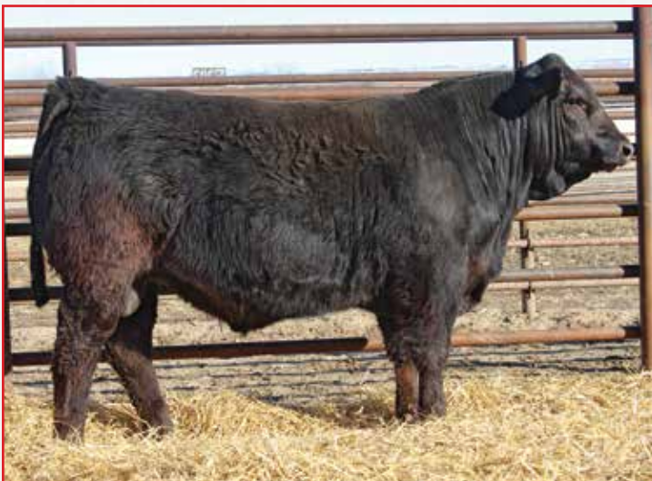
WULFS GAYLORD C904G • Sire of Lot HUNT Gaylord 39L

HUNT 39L is another HOMO black and HOMO polled standout bull. We are really liking our Gaylord-sired calves, and 39L is no exception. He has a lot of natural width and depth, good scrotal development and a solid, square foot. Give him a look if you want to add width and depth to your calves. Find his video at www.huntlimousin.com