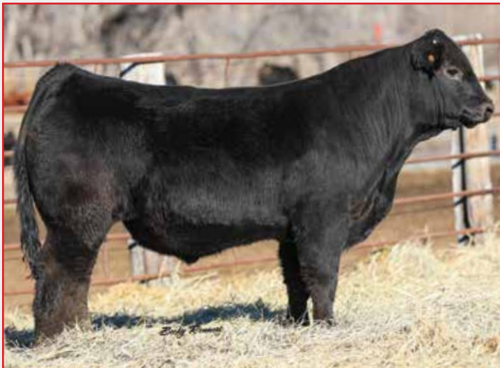
HUNT LONGMIRE 83L

HUNT 73L is a HOMO black, scurred, PUREBRED by Heartland and a really nice older daughter of Yankee. If you finish out your calves this bull is a good choice, as he's in the Top 1% for Carcass Weight EPD. Long sided, deep chest floor and plenty of frame to produce 1,575 pound steers, and he is as calm as a kitten. Great attitude and huge nuts. Find his video at www.huntlimousin.com