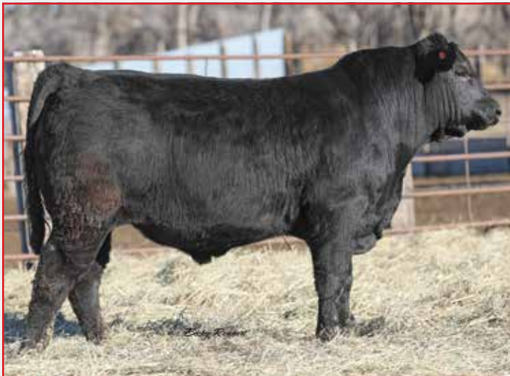
HUNT LUBBOCK 180L

The mating of El Toro with an older, proven Stimulus daughter really worked well here. 54L is DOUBLE HOMO and has that great 'wedge' shape...wide in the rump then goes inward to a clean, angular shoulder. He takes a long step, lands on a good square foot and is real easy going. This 50% Lim-Flex should be on the top of your list. Find his video at www.huntlimousin.com