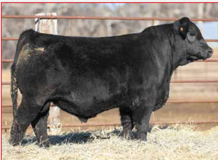
HUNT L.A. GUNS 90L

If you are looking to add muscle to your calves, take a look at 83L. Packed full of product from the front to the rear, and in the upper percentiles for both WW and YW. Find his video at www.huntlimousin.com