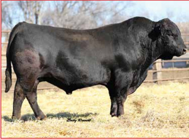
HUNT BILLY RAY 80B • Sire of Lot HUNT Billy 28L