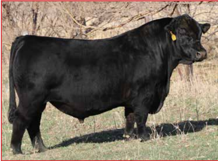
AHCC HEARTLAND 901F ET • Sire of HUNT Heartland 73L