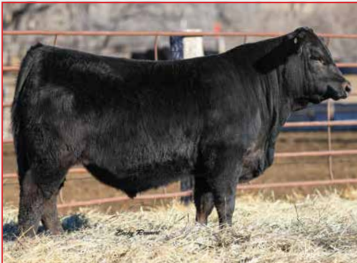
HNHT MATILDA 35L