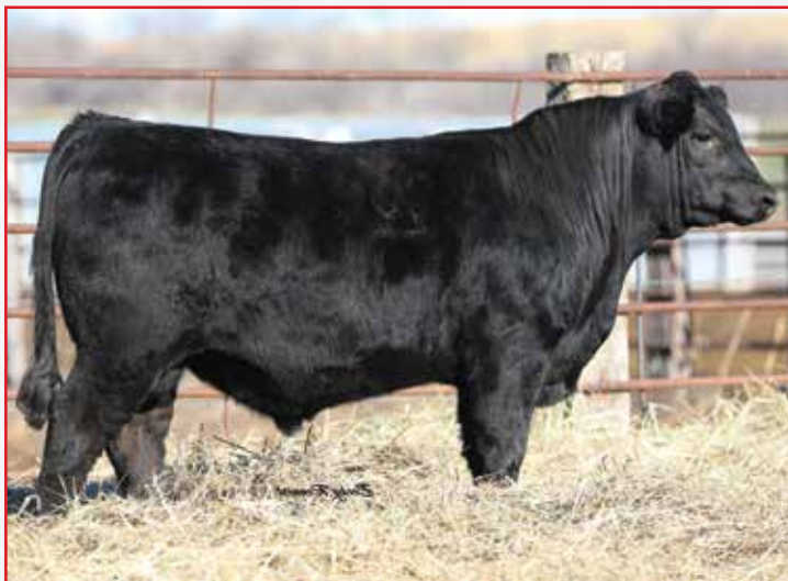
HUNT MR DAKOTA 04L