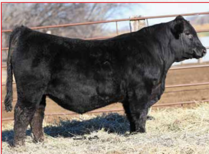
HUNT ELLIS 111L