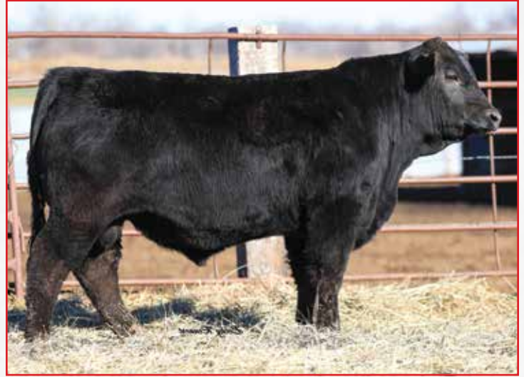
HUNT BILLY 28L